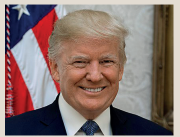
Since the mid-term elections in the United States, Trump relaunched in the race for a second term...