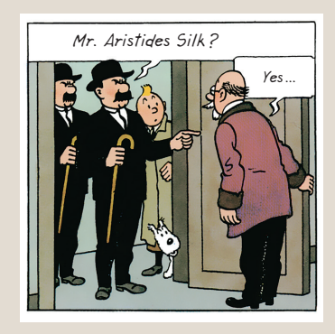
...Read page 10

No longer pursued in Europe's Capitals. Notice to pick-pockets Meet with Aristides Silk,